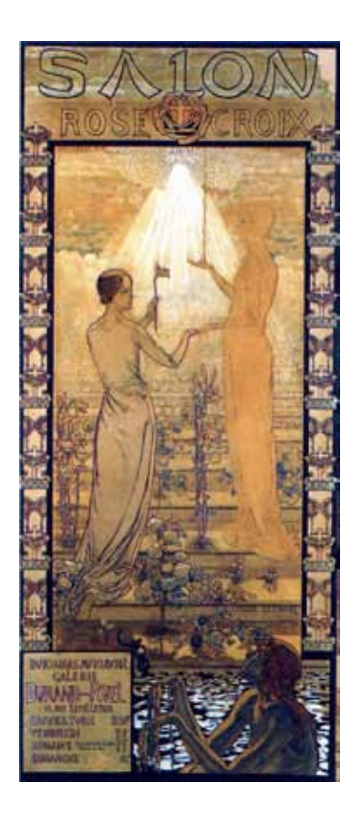
Poster for the Rosicrucian Salons, 1892.