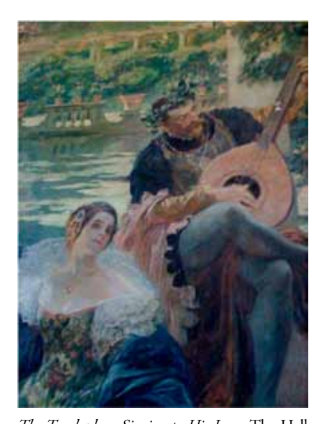
The Troubadour Singing to His Love. The Hall of the Illustrious in Toulouse's Capitole displays a series of three murals depicting a troubadour singing to his Love—as a young man, as a middle-aged man (as illustrated here), and as an elderly man. The woman, representing the eternal tradition, remains forever young in the series.

Following the intense persecution in the area, in 1323 seven individuals in Toulouse, known as the seven troubadours, founded a mystical society called the Gai Savoir , meaning "happy knowledge." The exoteric mission of